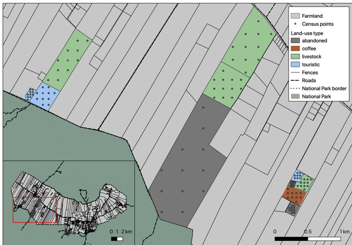
Fig. 1. View of the western agricultural area in the highlands of Santa Cruz Island, Galapagos [red rectangle on inset of entire agricultural area] where a monthly giant tortoise survey took place. Small circles depict the location of the 108 survey points and their distribution in different land-use types on three different properties.

The highlands supports three main livelihoods: cattle ranching, crop production, and tourism (Laso et al., 2020). The agricultural area has developed into a complex matrix of various land-use types, that includes pastoral areas for cattle and horses, annual crops (e.g., tomatoes, watermelons, corn), permanent crops (e.g., coffee, banana, pineapple), abandoned land, and tourism (Laso et al., 2020). Since the 1960 s, the tourism industry has grown steadily and now brings over 200,000 visitors each year, making tourism the backbone of the local economy in the Galapagos (Dirección del Parque Nacional Galápagos and Observatorio de Turismo de Galápagos, 2020; Epler, 2007). The rise in tourism has led some landholders to abandon productive land for more lucrative options in the tourism sector, predominantly in the township (Benitez-Capistros et al., 2019; Sampedro et al., 2018). A few other farmers have encouraged tourism in the highlands by re-purposing part of their farms, mostly for accommodation, or to attract tourists who pay to see giant tortoises roam their land in a semi-natural setting (Benitez-Capistros et al., 2016). Sections of abandoned land are now interspersed throughout the agricultural area and are mostly overgrown with invasive species that spill over into the neighbouring farms.